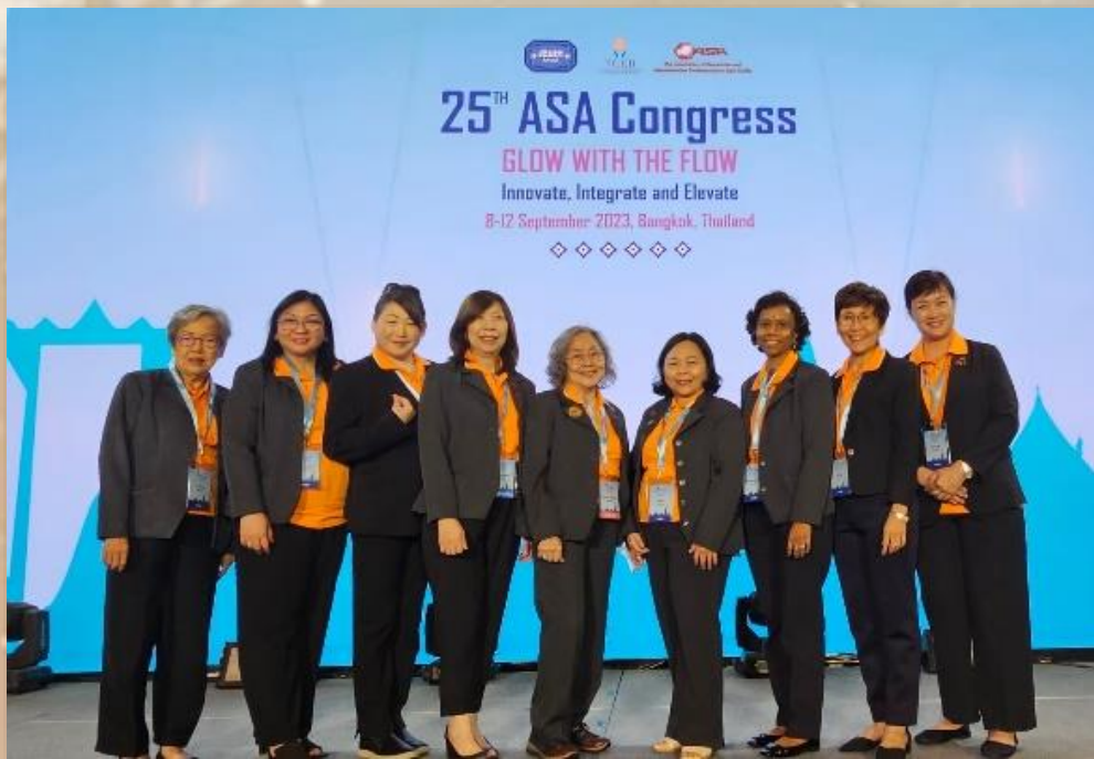
SAAP's Delegates in SAAP's Corporate T shirts

A significant highlight of the day was the ASA Bazaar held in the afternoon. Each member country was provided with a space to display products and facilitate sales. We had an opportunity to showcase a variety of items, all contributed by some SAAP members. The sales proceeds from these items were donated to a charitable cause through APSAT. SAAP managed to collect Thai Baht 11,260, equivalent to approximately S$424.