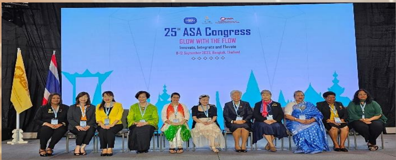
Council of Presidents

Throughout the day, experts from various fields delivered enlightening presentations covering the latest developments and trends. The interactions with colleagues from diverse backgrounds, each offering a unique perspective on shared challenges, proved invaluable. Additionally, we gained insights into our counterparts' initiatives and research projects in other member countries.